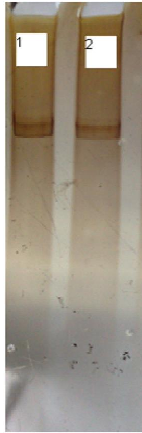
Figure 1 Native electrophoresis shows the same protein. Line 1 with fibrinolytic activity and line 2 with coagulation activity

performed first at low temperature (4 °C), during two hours. After this, the coagulation activity was confirmed. On the other side in similar conditions of buffer and precipitant solution another precipitation carried out at 25 °C, during 12 hs. Lysis activity happened at this temperature; without denaturation in both cases. (Figure 2) The electrophoretic migration of this protein, in 10 % polyacrilamide shown one component with the same electrophoretic mobility. These proteins bands corresponds for both pH 8 to 8.5 (lane 1) with coagulation results and 8.6 to 9 (lane 2) with lityc activity. precipitation and 4 °C (lane 1) and 25 °C (lane 2) Respectively. There is no doubt that this is the same protein, but are different in terms of the activity of the same according to the environments conditions in which was precipitated. (Figure 3)